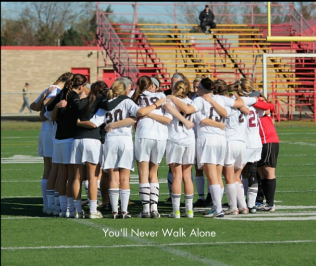
2011 Rocky River High School Girls Soccer