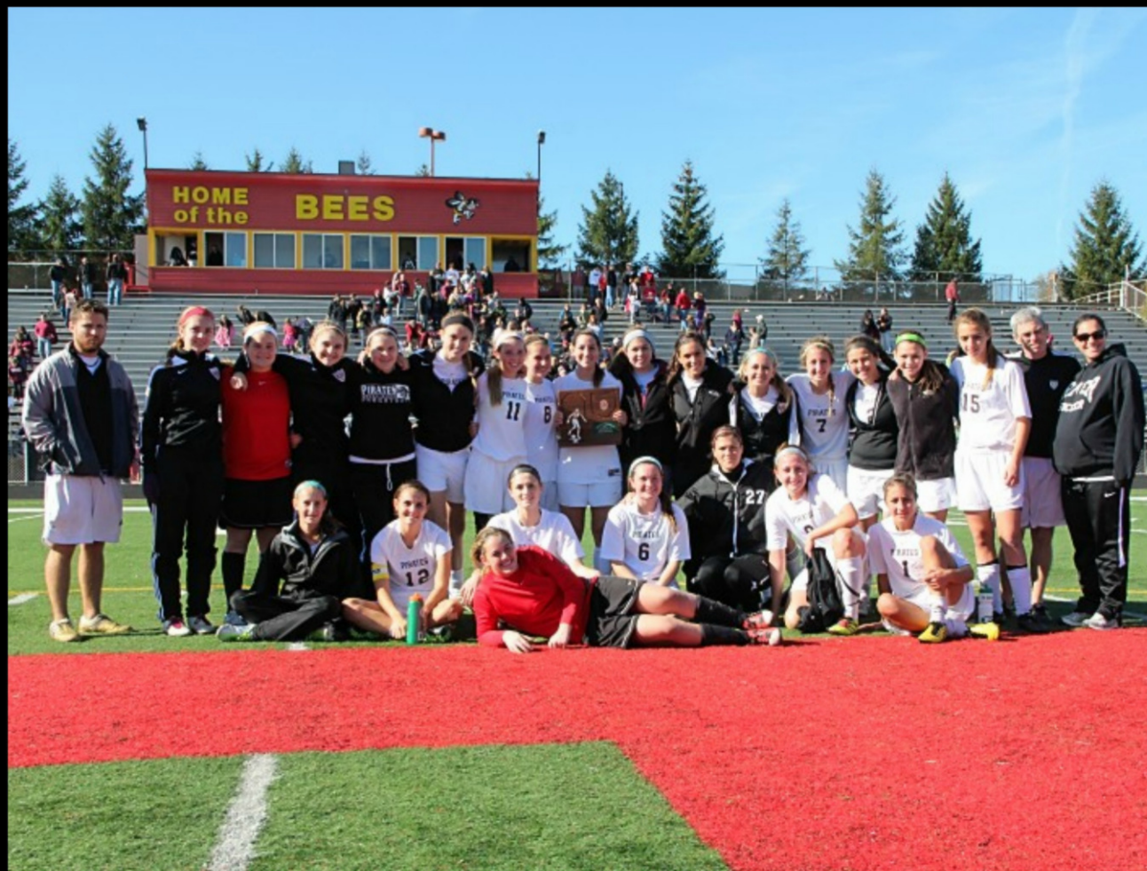
2011 Rocky River High School Girls Soccer Team (18-2-1) West Shore Conference Champions, Elite Eight Finalists